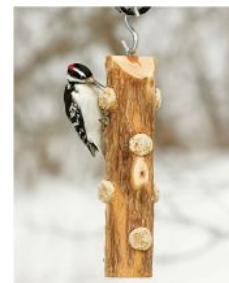
Scenes at Masonville Cove: Lovely holiday wreath created at Community Holiday Program; Other ornaments made at the Holiday Program; Observing waterfowl on end of year Nature Walk; & Hanging Log Bird Feeder