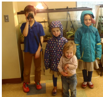
Budding Naturalists preparing for a Nature Walk

the conservation area, learn about the MC project, and see some of the creatures that inhabit this urban refuge. These walks are free. Maryland Master Naturalists or Environmental Educators will guide you and answer your questions during these hour-long walks.