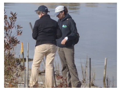
Scenes at Masonville Cove: Larva of a sphinx moth discovered by Johns Hopkins volunteers ; Navy personnel and Ben Franklin HS students departing for shoreline clean up; Johns Hopkins Volunteers from APO service fraternity at garden clean up; monitoring plant growth at the living shoreline.