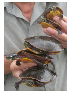
Scenes at Masonville Cove: Monarch larvae observed on common milkweed plant; Great Blue Heron wading with bulk carrier in background; Goats in trial grazing plot in conservation area; Painted turtles collected at 2nd BioBlitz.