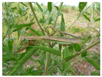
Scenes at Masonville Cove: Spotted Bee Balm in bloom; Ethan enjoys the parachute in the Bay Buddies program; Autumn discovers a fish caught on a boat ride; Praying Mantis with her mate.